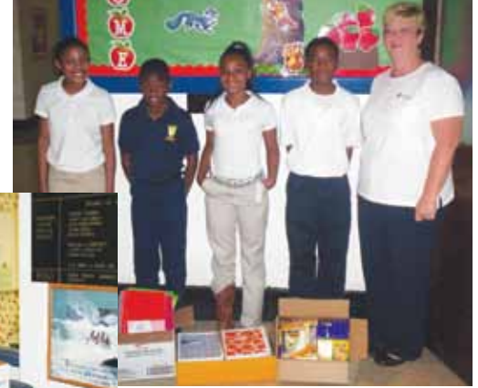
Supplies being delivered to Newman Elementary in Mansfield (left) and Rosary School in Toledo (above).